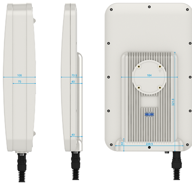
Outer dimensions WiBOX Extra Large Slim