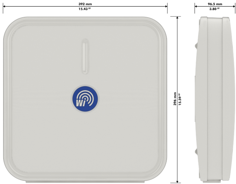
Outer dimensions WiBOX Large