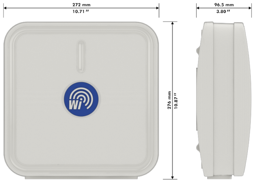
Outer dimensions WiBOX Medium