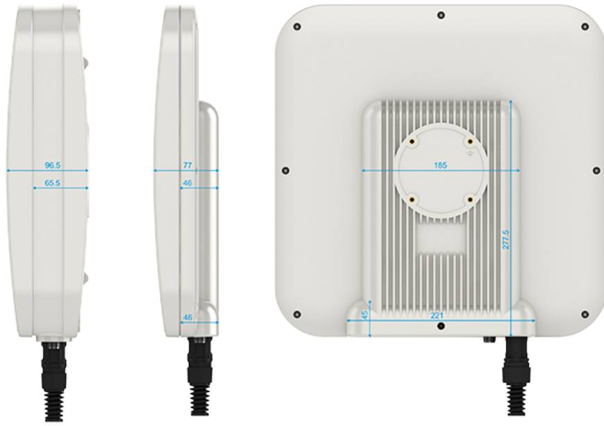
Outer dimensions WiBOX Large Slim