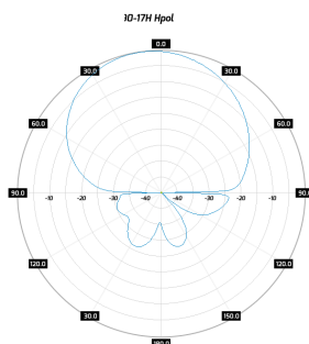
Radiation pattern WiBOX SA 5-90-17H Pol H