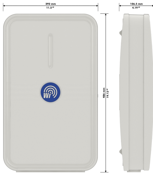
Outer dimensions WiBOX Extra Large